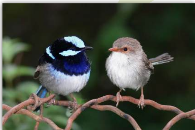
Superb fairy-wren – the bright blue male is easy to pick

For over a year the members of the Native Animal Club and the Year 11 Native Animal Studies classes have been stealing a little bit of time here and there to renovate an old possum cage into an aviary that mimics the environment of the Adelaide Hills. This includes the planting of a variety of native species including callistemon and correa species. It has taken quite a while to complete because this work has been done around all the regular tasks of feeding, cleaning and maintenance in the native animal sanctuary. The initial inhabitants are diamond fire-tail finches, peaceful doves and superb fairywrens, all of which naturally inhabit bushland areas of the hills. All three species are new to Urrbrae, and we are very excited by their arrival. The fairy-wrens are a particularly welcome addition with the beautiful blue breeding colours of the male and the animated way in which they search about the aviary for food. Being insect eaters, the fairywrens present some challenges when it comes to keeping up the supply of bugs, but our experience with white-browed wood-swallows has been invaluable in helping get prepared. As we come in to breeding season the club members are hopeful that the supplies of nesting material supplied will result in new additions to the aviary community.