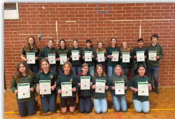
Year 8 Academic Excellence Award Winners