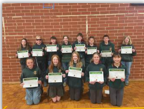
Year 7 Value Award Winners