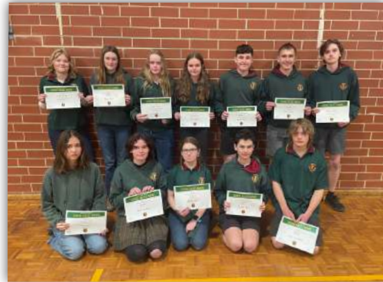
Year 9 Value Award Winners