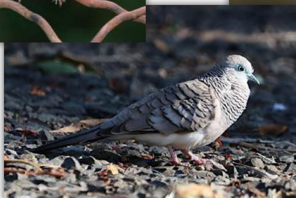
Peaceful Dove – subtle but beautiful colours