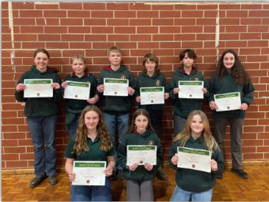
Year 8 Value Award Winners