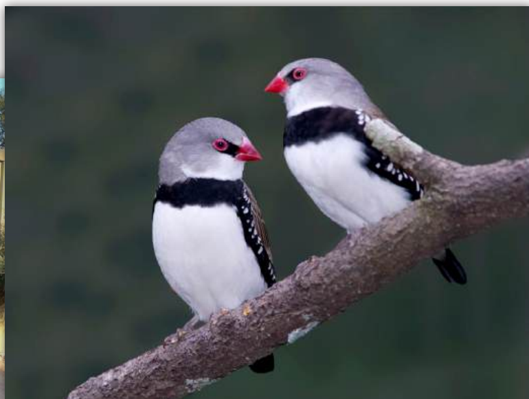
Diamond Fire-tail finches – Australia’s largest native finch

For over a year the members of the Native Animal Club and the Year 11 Native Animal Studies classes have been stealing a little bit of time here and there to renovate an old possum cage into an aviary that mimics the environment of the Adelaide Hills. This includes the planting of a variety of native species including callistemon and correa species. It has taken quite a while to complete because this work has been done around all the regular tasks of feeding, cleaning and maintenance in the native animal sanctuary. The initial inhabitants are diamond fire-tail finches, peaceful doves and superb fairywrens, all of which naturally inhabit bushland areas of the hills. All three species are new to Urrbrae, and we are very excited by their arrival. The fairy-wrens are a particularly welcome addition with the beautiful blue breeding colours of the male and the animated way in which they search about the aviary for food. Being insect eaters, the fairywrens present some challenges when it comes to keeping up the supply of bugs, but our experience with white-browed wood-swallows has been invaluable in helping get prepared. As we come in to breeding season the club members are hopeful that the supplies of nesting material supplied will result in new additions to the aviary community.