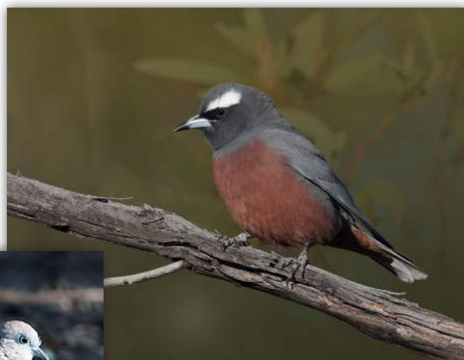
White-browed woodswallows – our practice species for insect eating birds