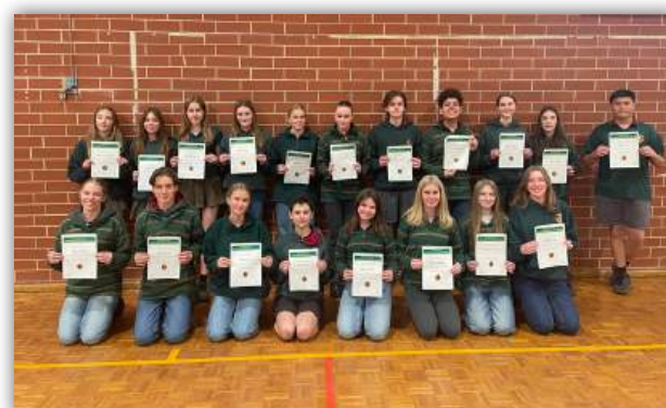
Year 9 Academic Excellence Award Winners