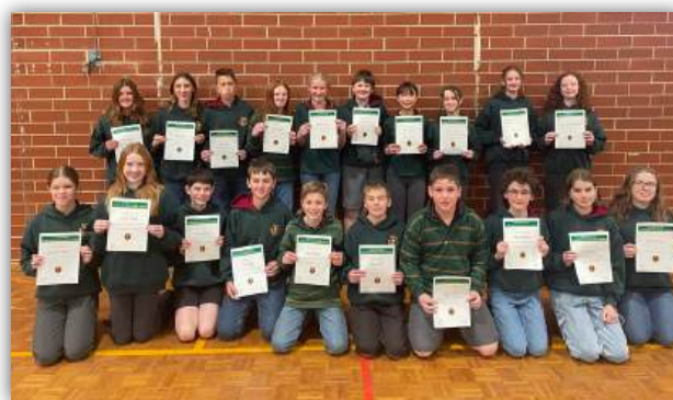
Year 7 Academic Excellence Award Winners