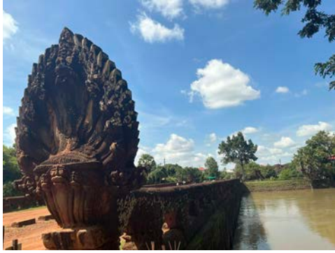
Ankor Era Bridge - 900 years old - still operational