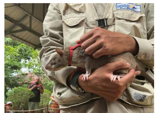
One of the mine detecting "Hero Rats"