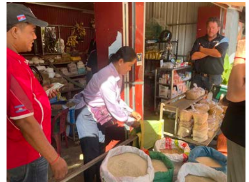
Negotiating for pig feed at a local fodder shop