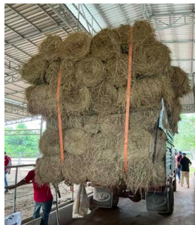
Rice straw delivery