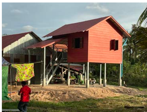
The house our tour group build for an impoverished family