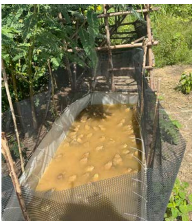
A frog farm