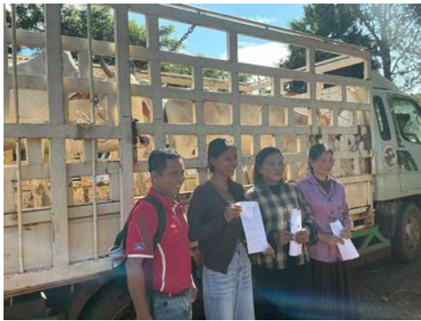
Three very happy recipients of cows