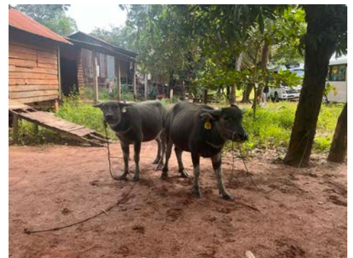
Water buffalo are also part of the "cow bank"