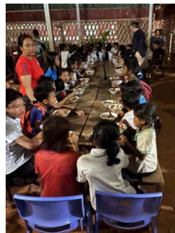
Cows for Cambodia School