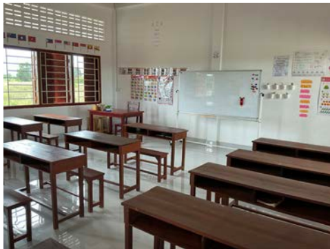
Classroom in the Agriculture School at the C4C farm