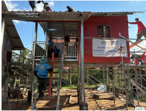
Volunteer house build