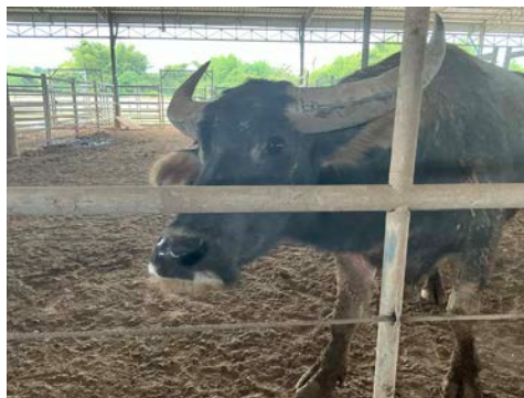
Breeder water buffalo