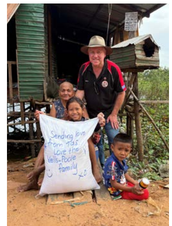
Rice run donation