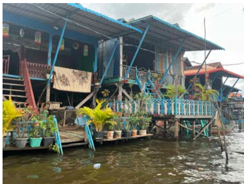
The "floating" village